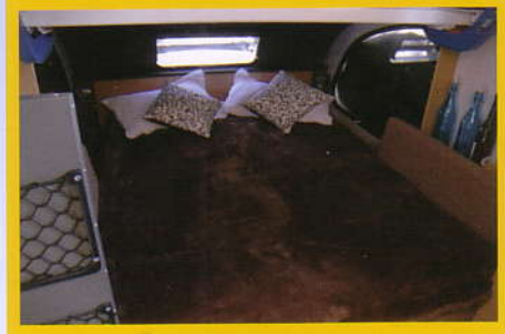
QUEEN SIZE BED