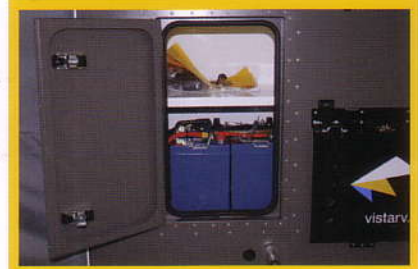
BATTERY UPGRADE 2 X 100 AMP GEL BATTERIES