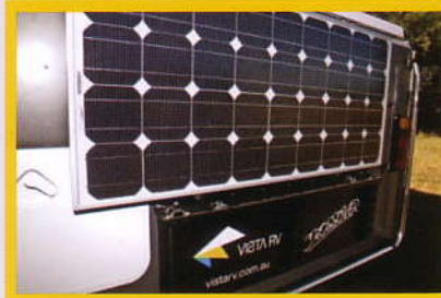
SOLAR PANEL OPTIONAL