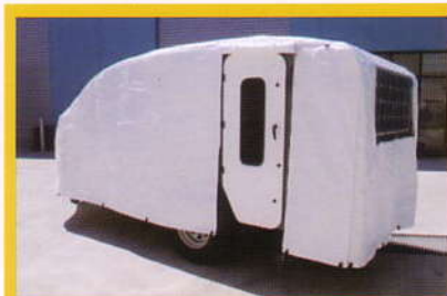
FULL COVER WITH ACCESS