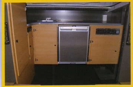
80 LITRE FRIDGE