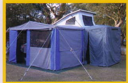
FULL ANNEX AND ENSUITE