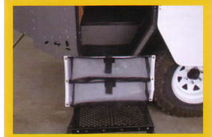
FLY SCREEN & SIDE POCKETS