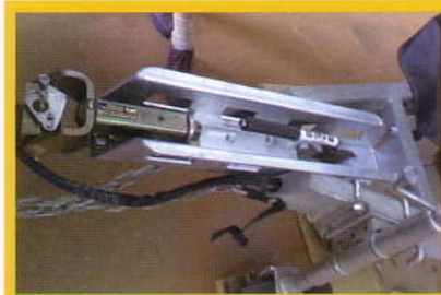
EXTENDED DRAW BAR